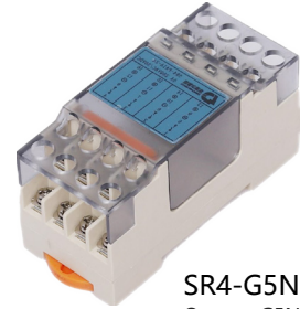
SR4-G5NB-24 Omron G5NB 系列