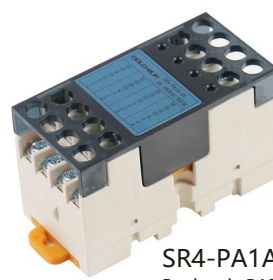
SR4-PA1A-24 Panasonic PA系列